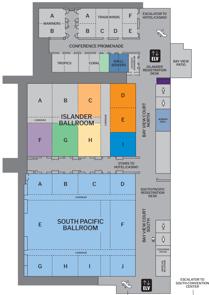
NORTH CONVENTION CENTER